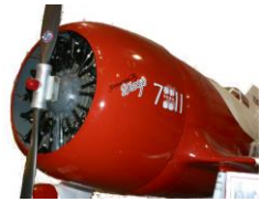
Jack Reed prepares for first Buddy-Box Flight